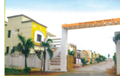
Sai Srinivasa Nagar, Phase 1, 2 & 3 Kesarapalli