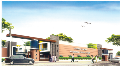
Sai Krishna Township Kesarapalli