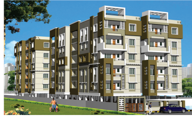
SGR Towers Poranki