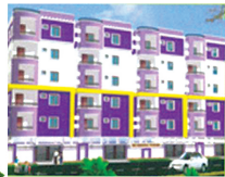
Sri Krishna Towers Penamaluru